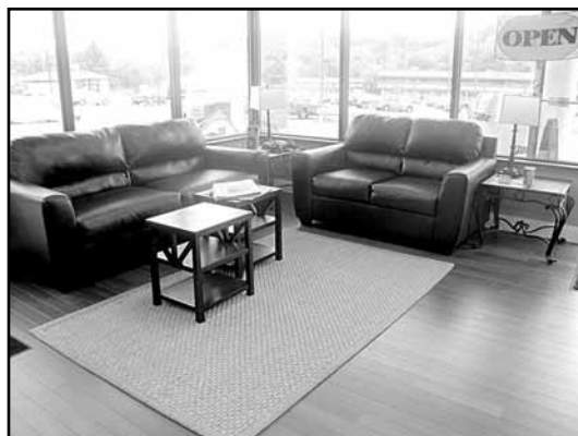
Our spacious waiting room

Full Service Oil Change & 4 Wheel Tire Rotation