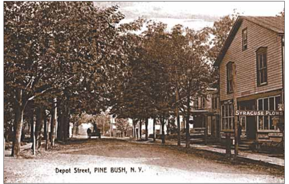
Depot Street, Pine Bush