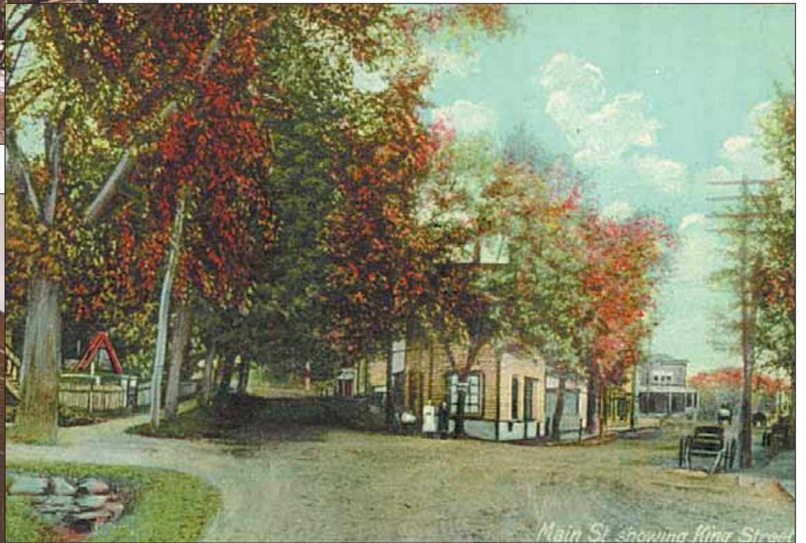
Main Street, Marlboro