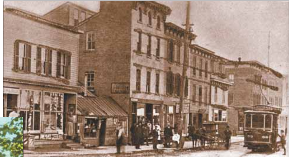
South side of Main Street, Walden, looking west