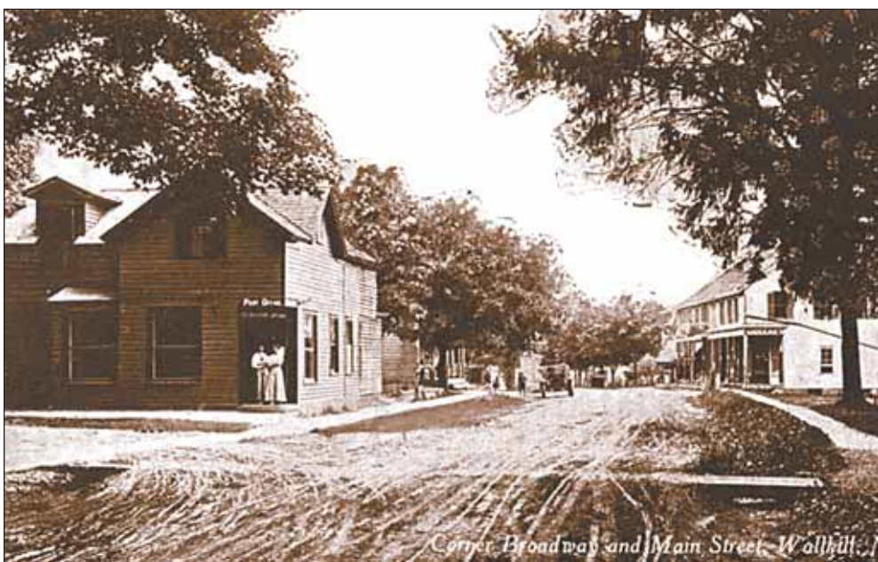
Corner of Broadway and Main Street, Wallkill.