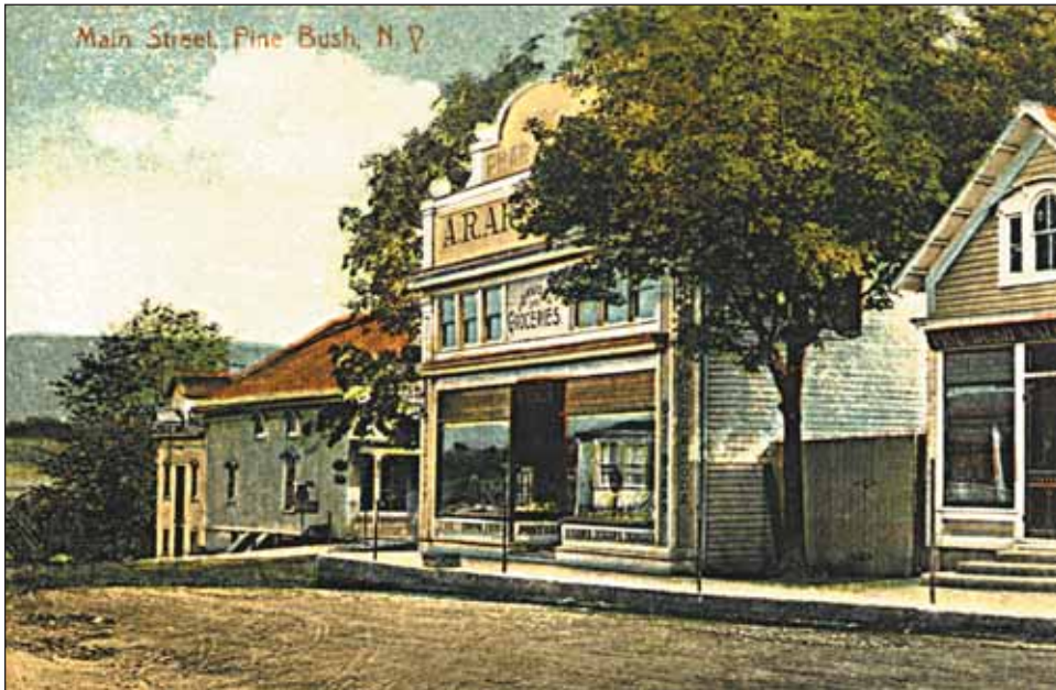
Main Street, Pine Bush