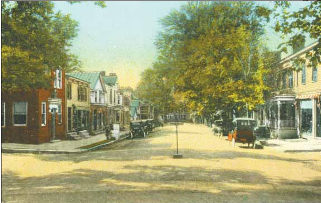
Corner of Union and Clinton Street, Montgomery