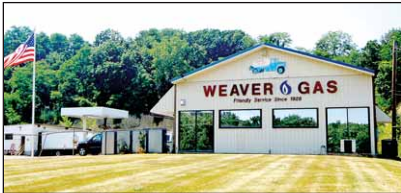
Visit our Website today for savings - enjoy year round peace of mind