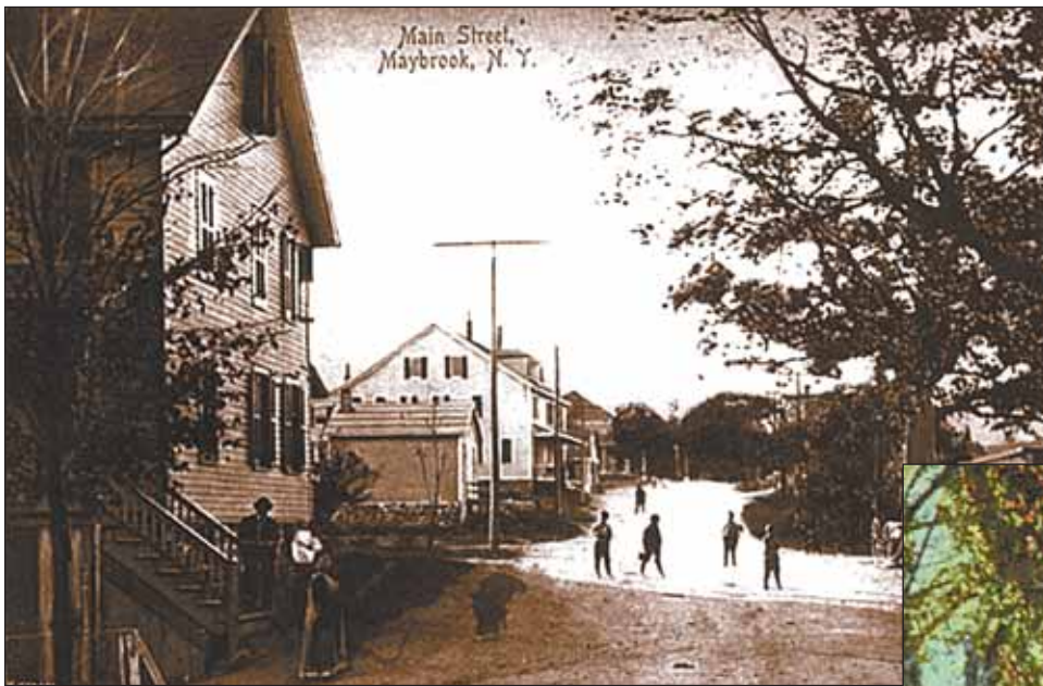
Main Street, Maybrook