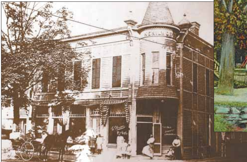
Vineyard and Milton St, Highland