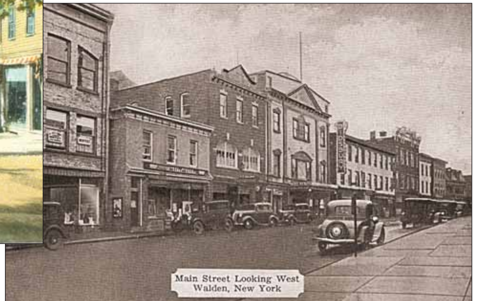
Main St., Walden looking west.