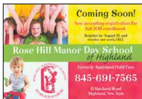
Top right: Highland location.