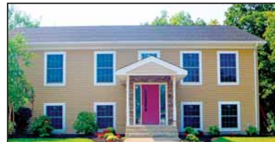
Middle and Bottom right: Beacon locations.